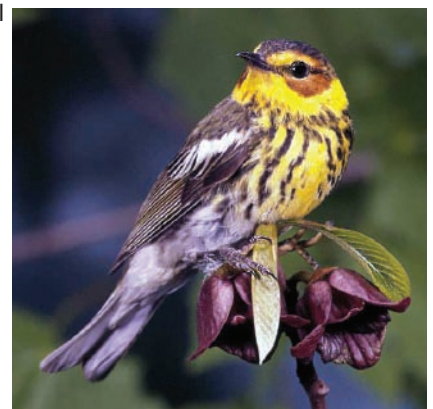
Cape May Warbler

Thanks to all the volunteers and a special thank you to our CBC Leaders Thad Edmonds, Dick Bjorklund and Tracy Fox.