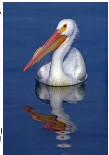
American White Pelican

Learn more at: http://conservation.audubon.org/mississippi-river-initiative