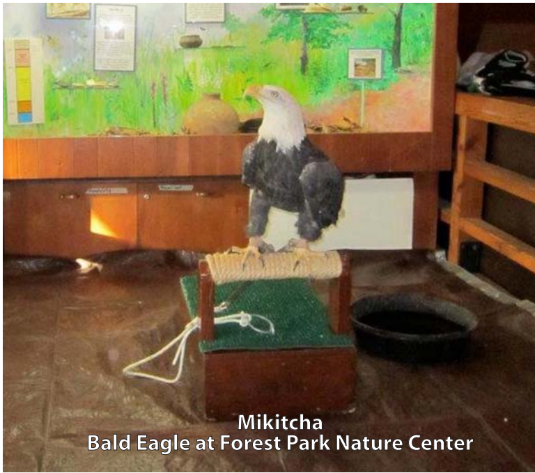
Mikitcha Bald Eagle at Forest Park Nature Center