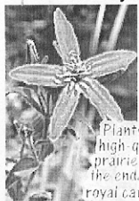
Plants in this high-quality prairie include the endangered royal catchfly.