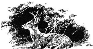
Whitetail in his evergreen hideout